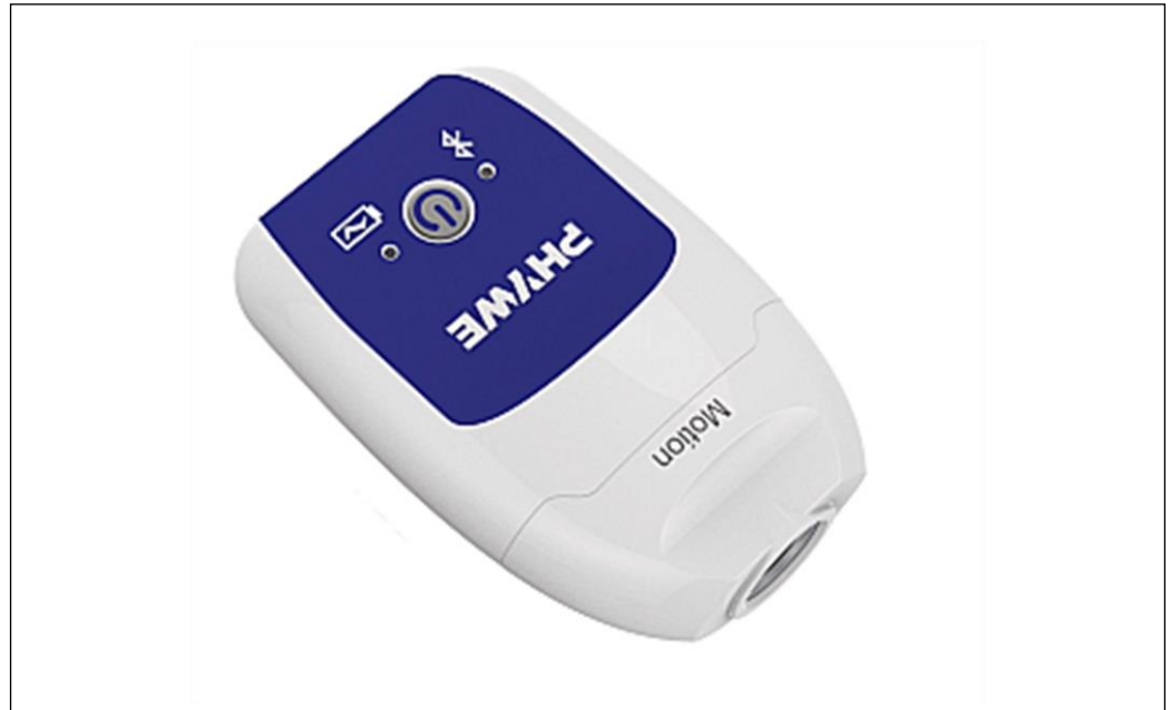
Fig. 1: 12908-01 Cobra SMARTsense Motion