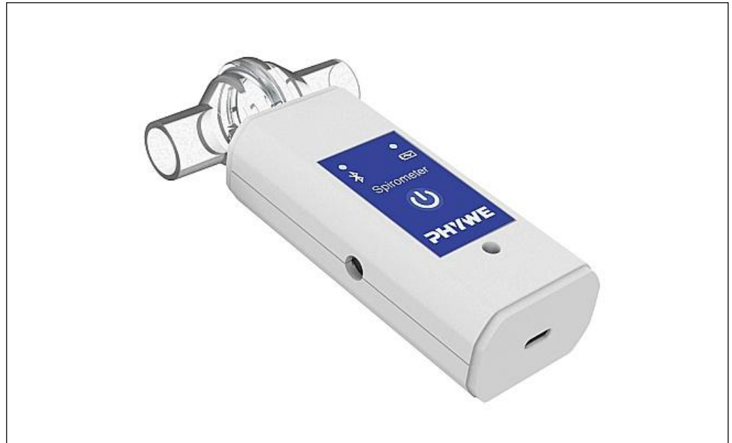
Fig. 1: 12936-01 Cobra SMARTsense Spirometer