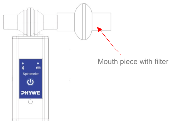
Fig. 2: Connecting the mouthpiece with filter

Attach the supplied mouthpiece with filter to the sensor.