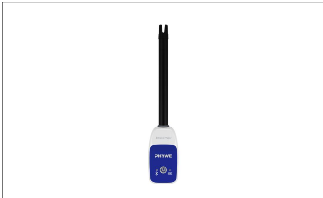
Fig. 1: 12948-00 Cobra SMARTsense Ethanol Vapor