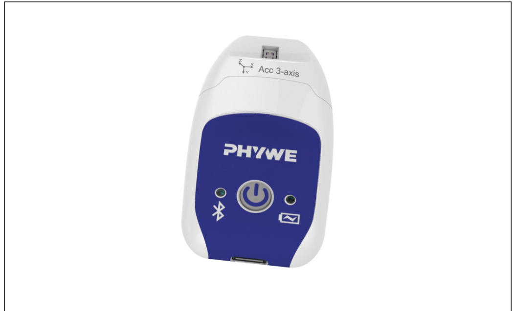
Fig. 1: 12907-01 Cobra SMARTsense Acceleration \pm 8 g