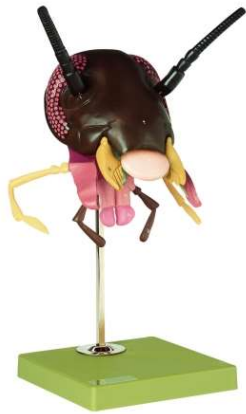
Article no:SOM-ZOS-48/6 Model of the Head of a Cockroach