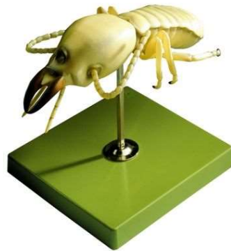
Article no:SOM-ZOS-49/14 Termite