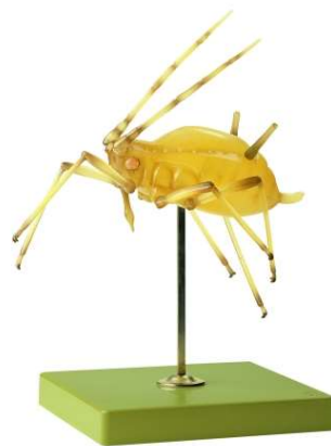
Article no:SOM-ZOS-49/22 Aphid