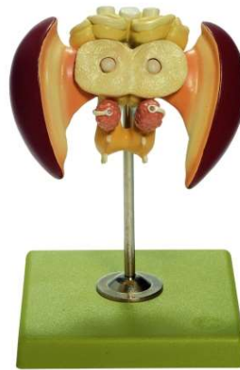
Article no:SOM-Z05-47/4 Model of the Brain of a Honey Bee