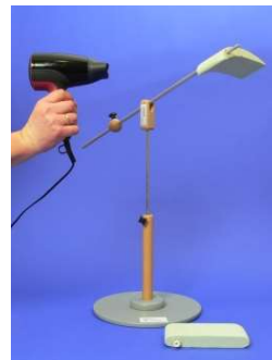
Article no:KLA-225-114 Bird flight - function model