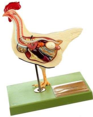
Article no:SOM-Z05-26 Domestic Hen