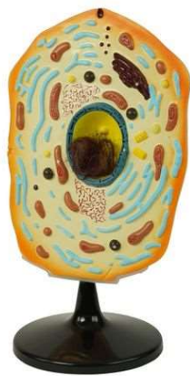
Article no:MOD-ANIMALCELL PHYWE Animal cell model