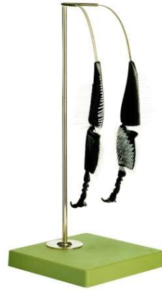
Article no:SOM-Z05-47/2 Model of the Hind Legs of the Bee