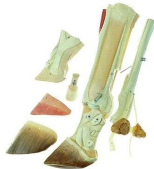
Article no:SOM-Z05-17 Cow's Hoof