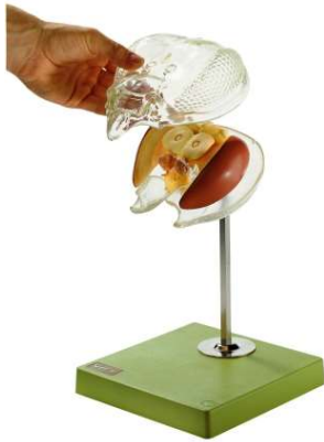
Article no:SOM-Z05-47/3 Model of the Brain of a Honey Bee with Transparent Head Capsule