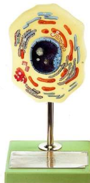
Article no:SOM-Z05-110/1 Animal cell, enlarged 10,000 times