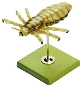
Article no:SOM-ZOS-49/20 Headlouse