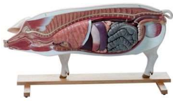
Article no:SOM-Z05-18/1 Model of a Breeding Pig (Dam)