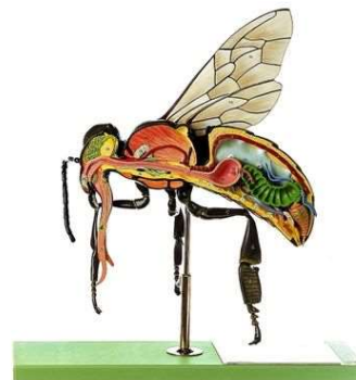
Article no:SOM-Z05-47/1 Model of the Worker Bee