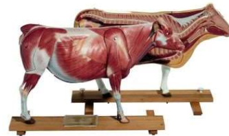
Article no:SOM-ZOS-1 Cow