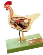
Article no:SOM-ZOS-26 Domestic Hen