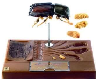
Article no:SOM-Z05-47/6 Bark Beetle - Development