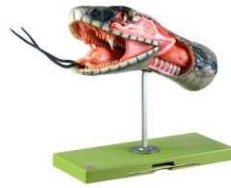
Article no:SOM-Z05-115 Anatomy of the Head of a Venomous Snake