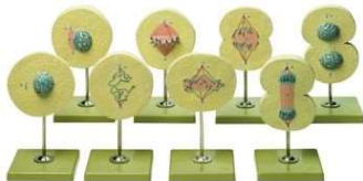
Article no:SOM-Z05-57 Cell division, 8 models in different phases