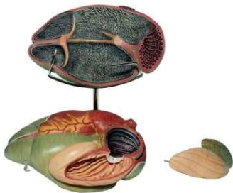
Article no:SOM-Z05-6/1 Ruminant Stomach of the Cow