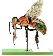
Article no:SOM-ZOS-47/1 Model of the Worker Bee