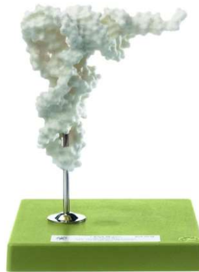
Article no:SOM-Z05-57/30 T-RNA MODEL