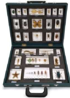
Article no:3BS-1005970 Teaching Case "27 Invertebrates (Invertebrata)"