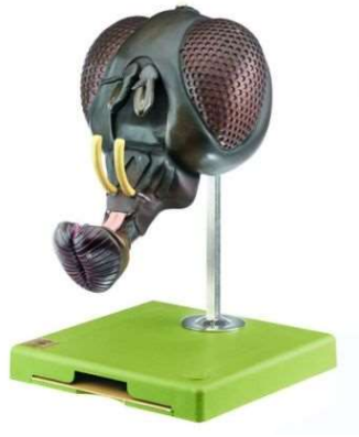
Article no:SOM-ZOS-48/4 Head of a Fly