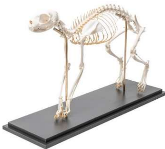
Article no:3BS-1020970 Cat skeleton (Felis catus)