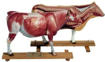
Article no:SOM-Z05-1/1 Cow