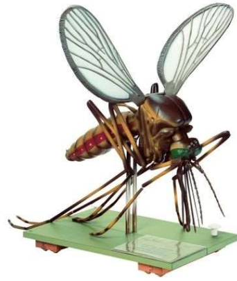
Article no:SOM-ZOS-48/5 Model of a Mosquito