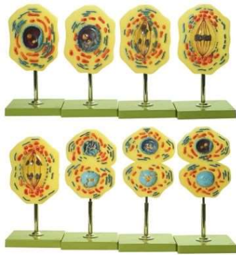
Article no:SOM-Z05-57/1 Mitosis