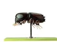
Article no:SOM-ZOS-47/5 Bark Beetle