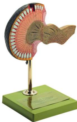
Article no:SOM-Z05-49 Compound or Facet Eye