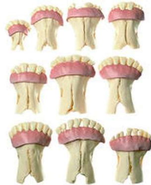
Article no:SOM-Z05-5 Models of Sets of Cow's Teeth