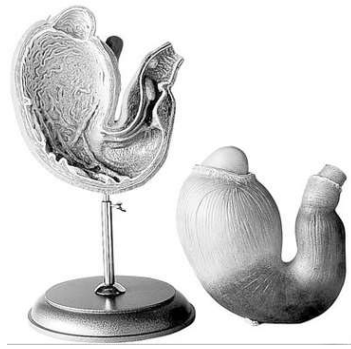
Article no:SOM-Z0-21 Stomach of the Pig